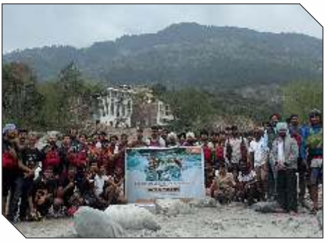
Water sports camp organized by youth services Punjab at ABVIMAS