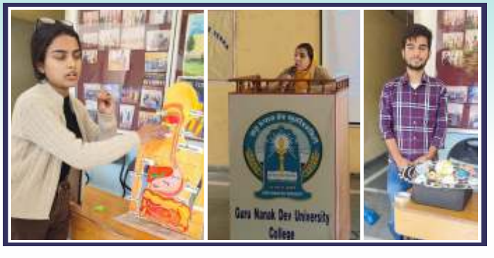
Science day celebrated on 28th Feb 2025