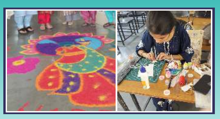
Competitions were held to celebrate diwali