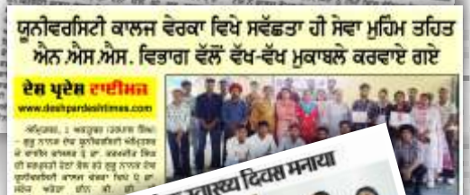
ਯੂਨੀਵਰਸਿਟੀ ਕਾਲਜ ਵੇਰਕਾ ਵਿਖੇ ਸਫਲਤਾਪੂਰਵਕ ਹੀ ਸੇਵਾ ਮੁਹਿਮ ਤਹਿਤ ਐਨ.ਐਸ.ਐਸ. ਵਿਭਾਗ ਵੱਲੋਂ ਵੱਖ-ਵੱਖ ਮੁਕਾਬਲੇ ਕਰਵਾਏ ਗਏ