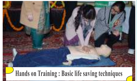
Hands on Training : Basic life saving techniques