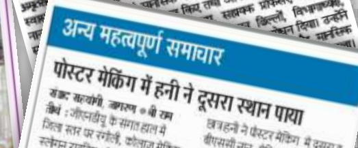
ਅਨੁ ਮਹਤਵਪੂਰਨ ਸਮਾਚਾਰ