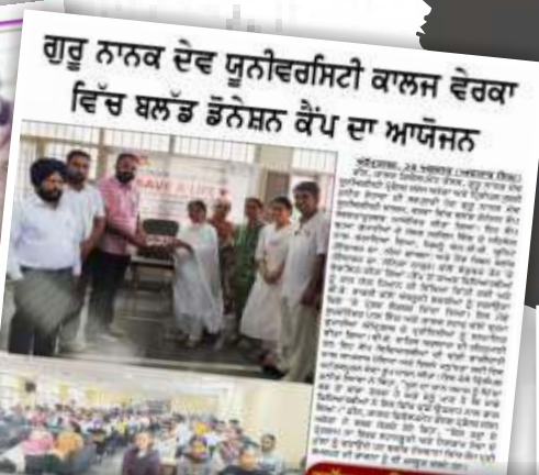
ਗੁਰੂ ਨਾਨਕ ਦੇਵ ਯੂਨੀਵਰਸਿਟੀ ਕਾਲਜ ਵੇਰਕਾ ਵਿੱਚ ਬਲੱਡ ਡੋਨੇਸ਼ਨ ਕੈਂਪ ਦਾ ਆਯੋਜਨ