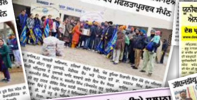
ਯੂਨੀਵਰਸਿਟੀ ਕਾਲਜ ਵੇਰਕਾ ਵਿਖੇ ਸਲਾਨਾ ਅਰਦਾਸ ਦਿਵਸ ਮਨਾਇਆ ਗਿਆ