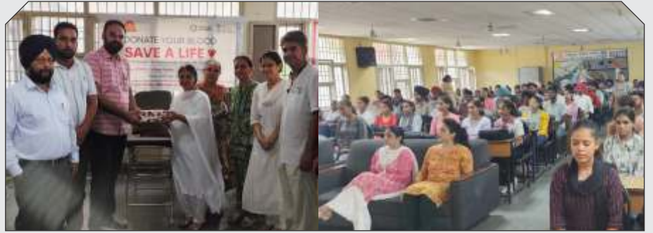
College organised Blood Donation camp, supported by Social Service Wing of Brahmakumaris, a spiritual organization