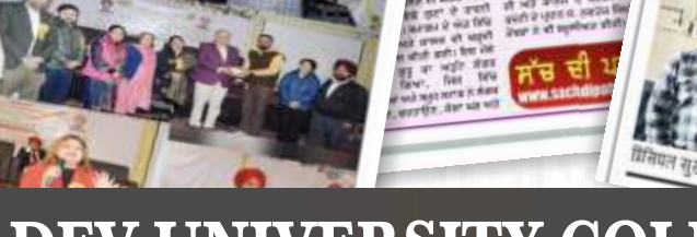
ਸੱਚ ਦੀ ਪਟਾਰੀ