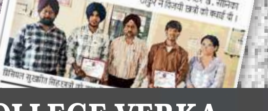
ਗੁਰੂ ਨਾਨਕ ਦੇਵ ਯੂਨੀਵਰਸਿਟੀ ਕਾਲਜ ਵੇਰਕਾ ਵਿਖੇ ਸਲਾਮਤੀ