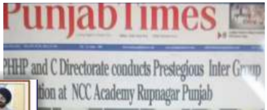
PHHP and C Directorate conducts Prestigious Inter Group Competition at NCC Academy Rupnagar Punjab