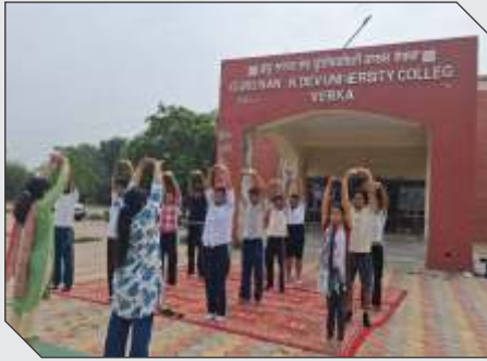
National Yoga Day