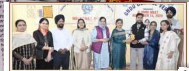
ਜੀ.ਐਨ.ਡੀ.ਯੂ. ਕਾਲਜ ਵੇਰਕਾ ਵੱਲੋਂ ਐਲੂਮਨੀ ਮੀਟ ਦਾ ਆਯੋਜਨ