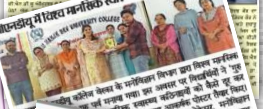
ਜ਼ੋਇਨਡੀਯੂ ਸੋ ਵਿਕਰ ਮਾਨਸਿਕ ਸਿਹਤ ਵਿਖੇ ਸਲਾਮਤੀ