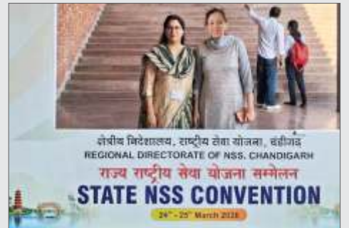
NSS Coordinators attended State NSS convention held at Chandigarh University Mohali