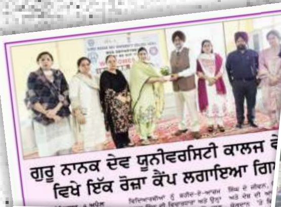
ਗੁਰੂ ਨਾਨਕ ਦੇਵ ਯੂਨੀਵਰਸਿਟੀ ਕਾਲਜ ਵੇਰਕਾ ਵਿਖੇ ਇੱਕ ਰੋਜ਼ਾ ਕੈਂਪ ਲਗਾਇਆ ਗਿਆ