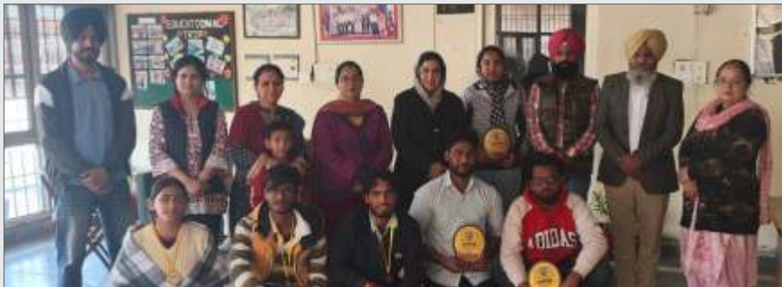
Students won trophies & medals in 'Natik Sikhya' paper conducted by Guru Gobind Singh Sikh study circle