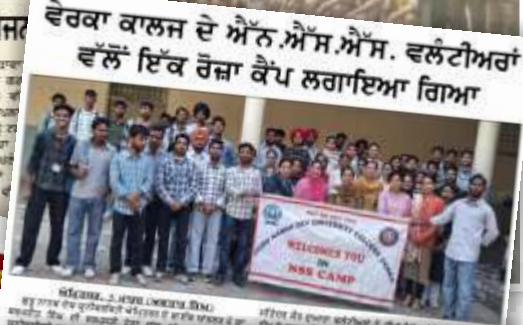
ਵੇਰਕਾ ਕਾਲਜ ਦੇ ਐਨ.ਐਸ.ਐਸ. ਵਲੰਟੀਅਰਾਂ ਵੱਲੋਂ ਇੱਕ ਰੋਜ਼ਾ ਕੈਂਪ ਲਗਾਇਆ ਗਿਆ