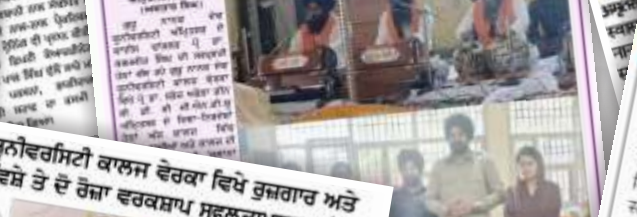
ਗੁਰੂ ਨਾਨਕ ਦੇਵ ਯੂਨੀਵਰਸਿਟੀ ਕਾਲਜ ਵੇਰਕਾ ਵਿਖੇ ਰੁਜ਼ਗਾਰ ਅਤੇ ਆਂਟਰਪ੍ਰੈਨਿਓਰਸ਼ਿਪ ਵਿਸ਼ੇ 'ਤੇ ਦੋ ਰੋਜ਼ਾ ਵਰਕਸ਼ਾਪ ਸਫਲਤਾਪੂਰਵਕ ਸੰਪੰਨ