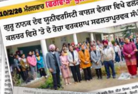
10/2/26 ਮੰਗਲਵਾਰ (ਫਗਵਾੜਾ ਬੁਲੇਟਿਨ) ਸਾਂਝਾ ਪੰਨਾ 4