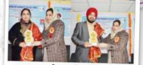
ਗੁਰੂ ਨਾਨਕ ਦੇਵ ਯੂਨੀਵਰਸਿਟੀ ਕਾਲਜ ਵੇਰਕਾ ਵਿਖੇ ਹੈਲਥ ਅਤੇ ਵੈਸਟਮੈਨਸ਼ਿਪ ਦਾ ਇੱਕ ਰੋਜ਼ਾ ਕੈਂਪ ਲਗਾਇਆ ਗਿਆ