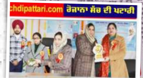
chdipattari.com ਰੋਜ਼ਾਨਾ ਸੱਚ ਦੀ ਪਟਾਰੀ