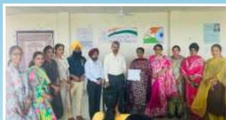
Award distribution on Constitution Day in Baba Naam Dev University College, Kishankot.