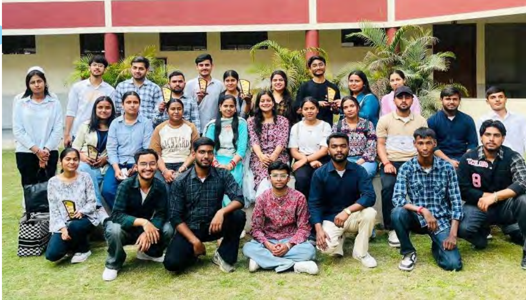
Guru Nanak Dev University College proudly secured various positions in “SPARK” organised by Apeejay Institute of Management & Engineering .