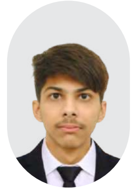
2nd in University B.VOC (E-Commerce & Digital Marketing) 80.7% May 2024