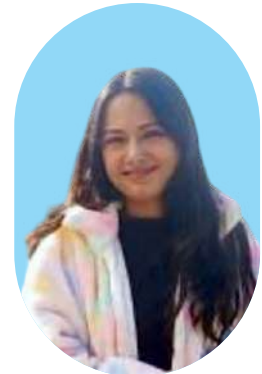
Muskan DMART CTC 3.5 Lakh