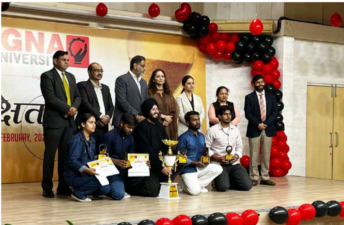
Guru Nanak Dev University College proudly secured the various positions along with a cash prize of ₹3100 at “Kshitiz” organised by GNA university.