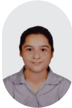
Jyotsna Gujarat Gas Ltd. CTC 7.2 Lakh