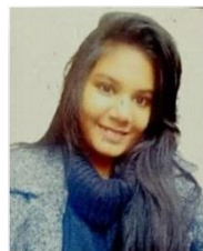
Silky Bcom 3 rd year